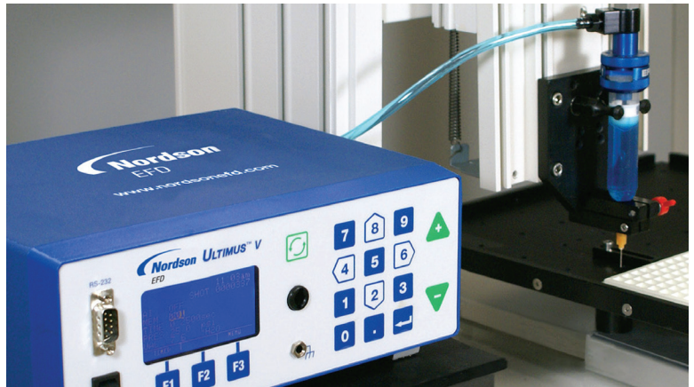
High speed microdot dispensing with Ultimius V and Optimeter.